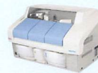
Thermo Fisher Indiko Plus Chemistry Analyzer