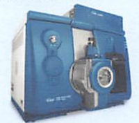
Sciex Triple Quad 5500+ LC-MS/MS