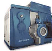
Sciex Triple Quad LC-MS/MS for Confirmation Test