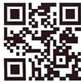
Client Portal / LIS